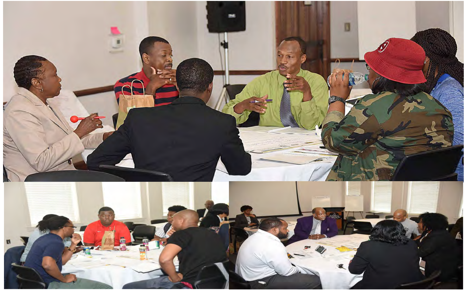
"ONE GRAMBLING: Honoring History, Keeping Promises, and Fulfilling Dreams"

The goals and initiatives identified in this Strategic Plan represent Grambling's systemic steps towards maximizing its strengths and opportunities and minimizing the impact of its weaknesses and the threats it faces to the University's future growth and development.