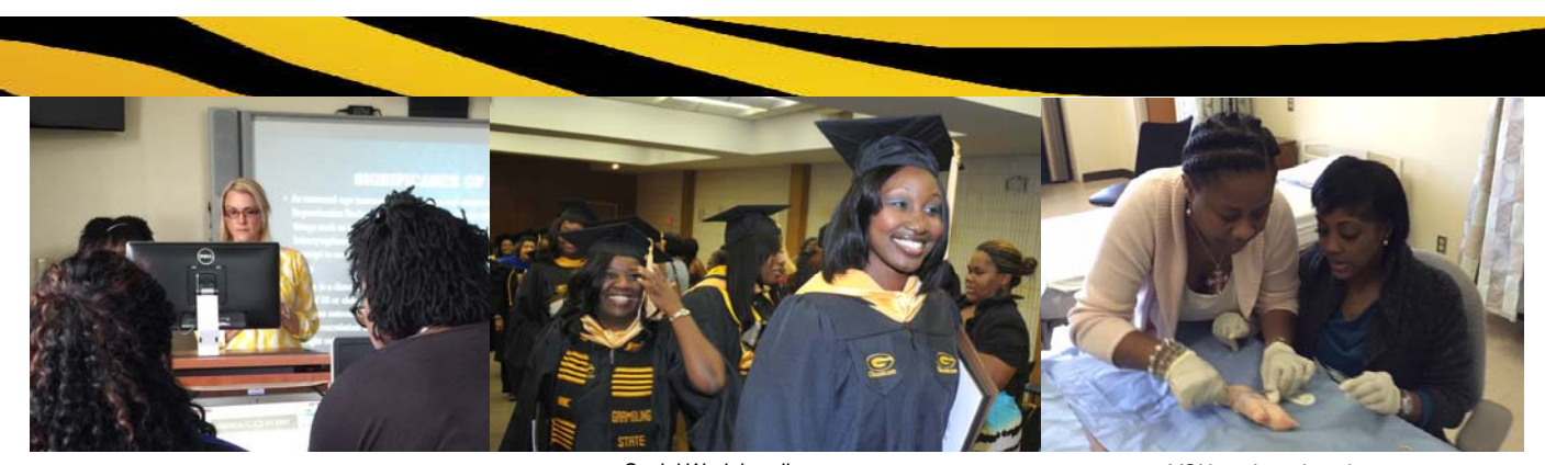
MSN student presentation

The graduate program also prepares students for advanced direct practice with individuals, families and groups in rural communities.