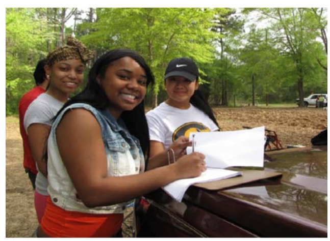
GSU students engaged in service-learning project.

Each year students average over 210,420 hours of service-learning activities. The economic impact of their service hours average over $1,525,545 annually. Because of its impact in the community, Grambling State University has been named to the president's Higher Education Honor Roll numerous times.