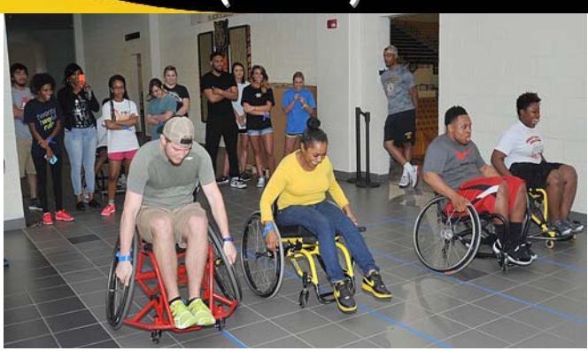
GSU-LA Tech sponsored KSLS Annual Spring Fling competition

become administrators of amateur, high school, college, professional or recreation/leisure programs, or administrators of other public/private sport, athletic or education related programs.