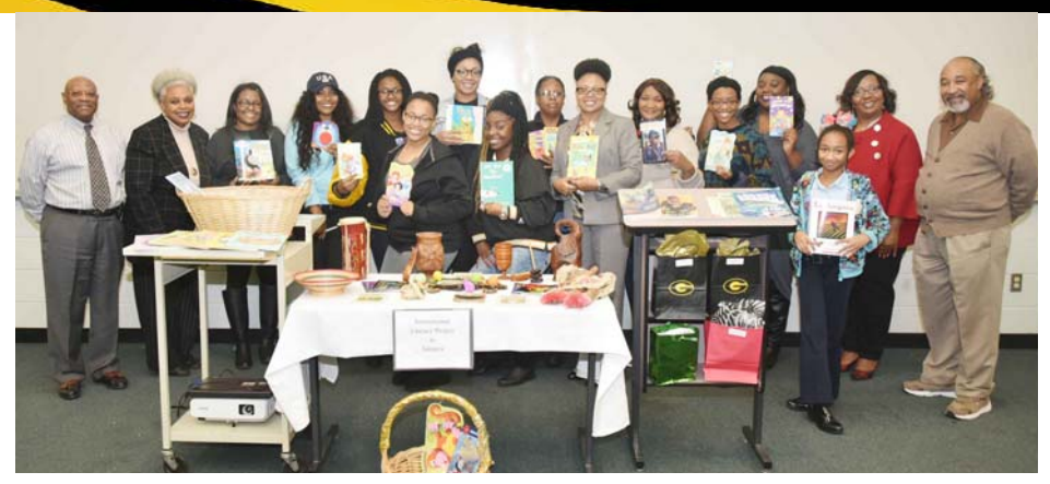
Kick-off Activity for the Global Delegation to Jamaica-Collaborative International Literacy Project

The Department of Curriculum and Instruction, the oldest department at Grambling State University, is accredited by the National Council for the Accreditation of Teacher Education (NCATE)/Council for the Accreditation of Educator Preparation (CAEP). The department is committed to preparing students for CAREERS as teachers and other school professionals who possess the knowledge, skills, and dispositions to become successful career educators.