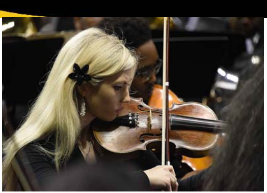
Annual President's Concert

both music majors and nonmusic majors; and to educate future music professionals through appropriate curricular offerings leading to a bachelor's degree in music or music education.