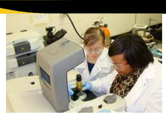
Chemistry students using Fourier Transform Infrared Spectrometer to analyze structure of a chemical compound

including: (1) the General Chemistry Concentration, which is tailored towards preprofessional CAREERS , such as pre-medicine or prepharmacy; (2) the ACS Certified Professional Concentration in Chemistry that is accredited by the American Chemical Society; and (3) the Forensic Chemistry Concentration.