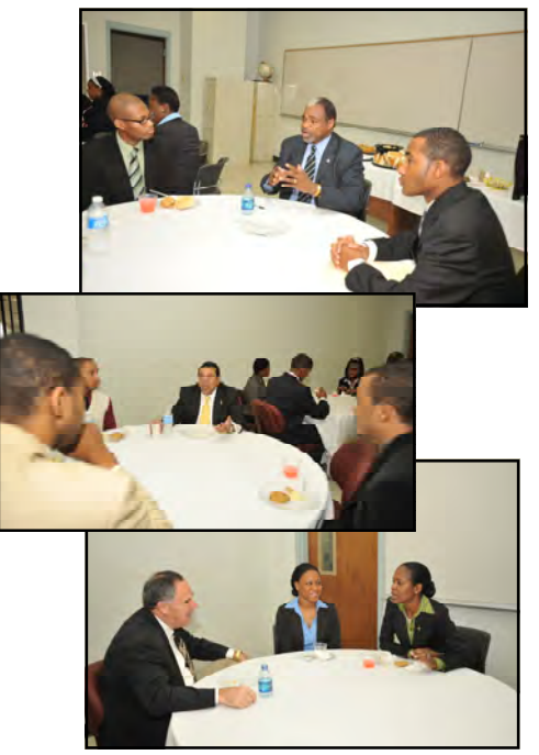
Student Leaders Participate in Luncheon with AACSB Visiting Team

College of Business student organizational leaders had the opportunity to have lunch with the AACSB Peer Review Team Members on Monday, February 22, 2010. This activity gave students the opportunity to interact and share their views about the College with the Team Members. Students and the Team Members both enjoyed the engagement.