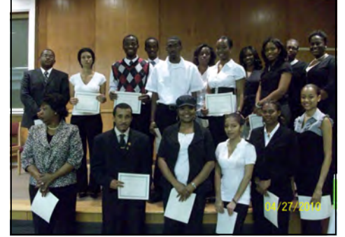
Accounting & Economics Graduates Spring 2010 Graduating Senior Gala