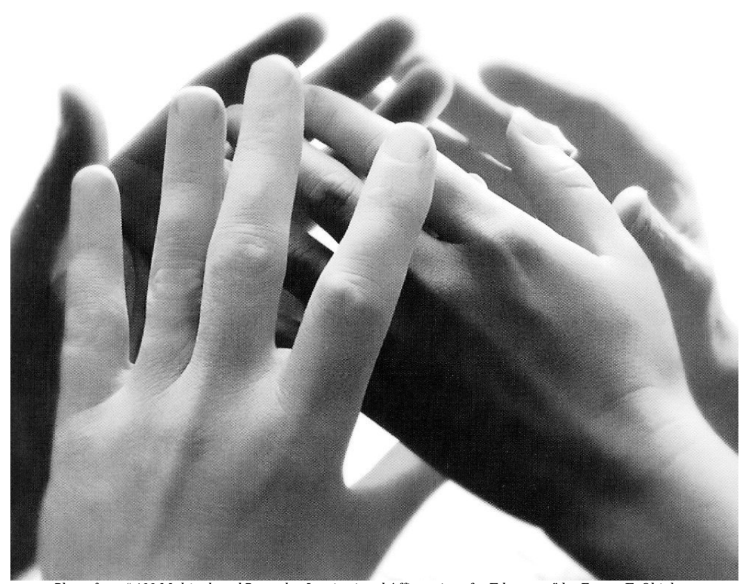
Photo from "100 Multicultural Proverbs: Inspirational Affirmations for Educators," by Festus E. Obiakor. Reprinted with permission of the author.