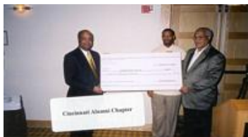
Individual Alums and Alumni Chapters nationwide support GSU monetarily.