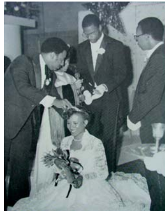
Coronation of Miss Grambling of 1982 (Above); 1982 Cheerleaders (bottom) with celebrity.