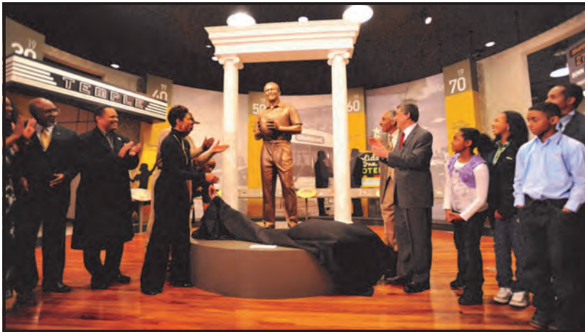
Family, friends and supporters gathered on February 13, 2010 for the ribbon cutting ceremony for the Eddie G. Robinson Museum.