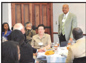
SACS Accreditation luncheon

National Council for Accreditation of Teacher Education (NCATE) April 24-28 ☞