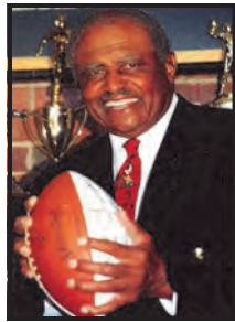
Coach Eddie Robinson