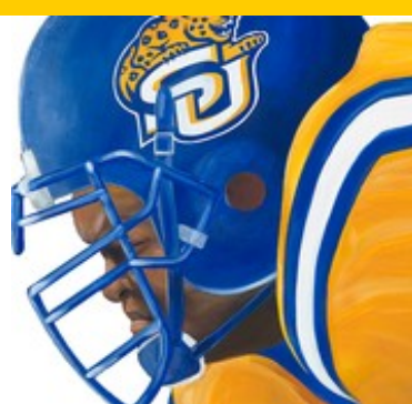
To stay up to date with upcoming events and details for the 41st Annual Bayou Classic visit, www.mybayouclassic.com.