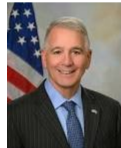
Congressman Ralph Abraham