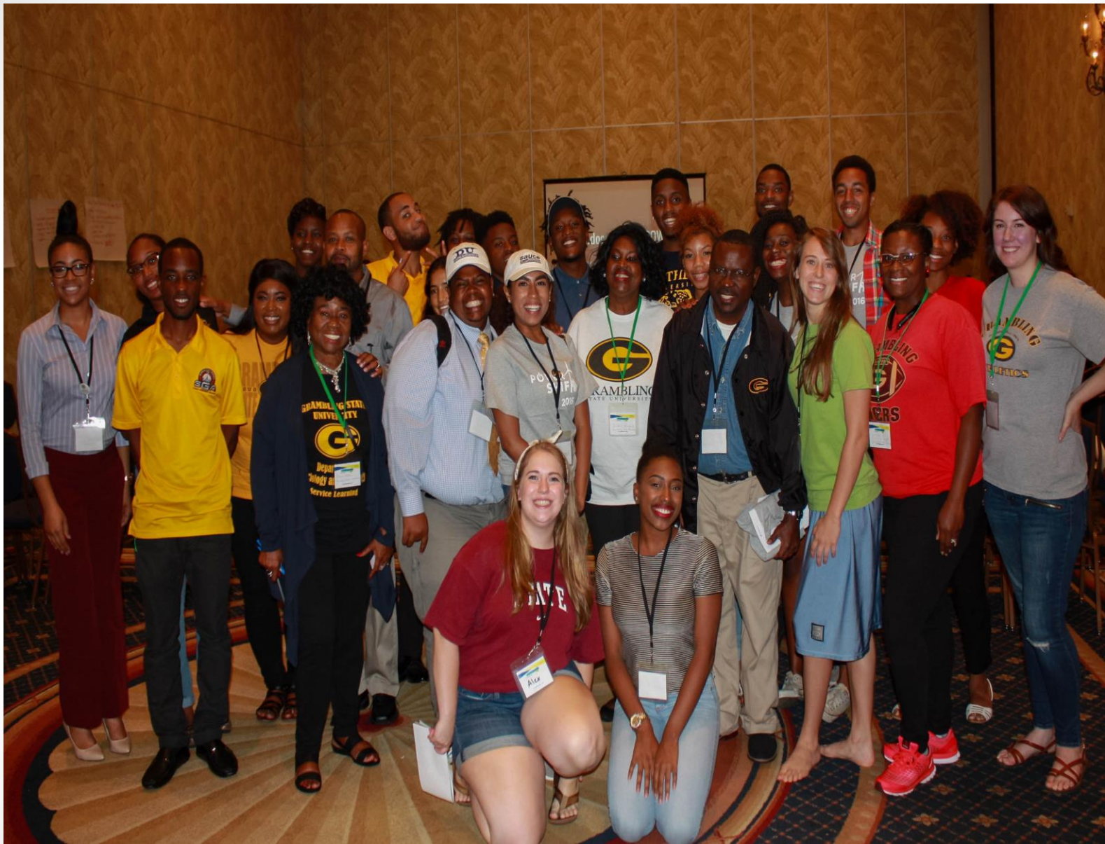
Mississippi & Louisiana