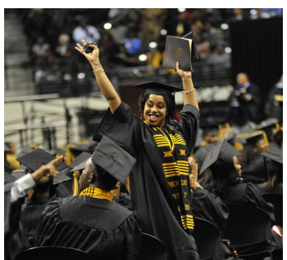
"ONE GRAMBLING: Honoring History, Keeping Promises, and Fulfilling Dreams"