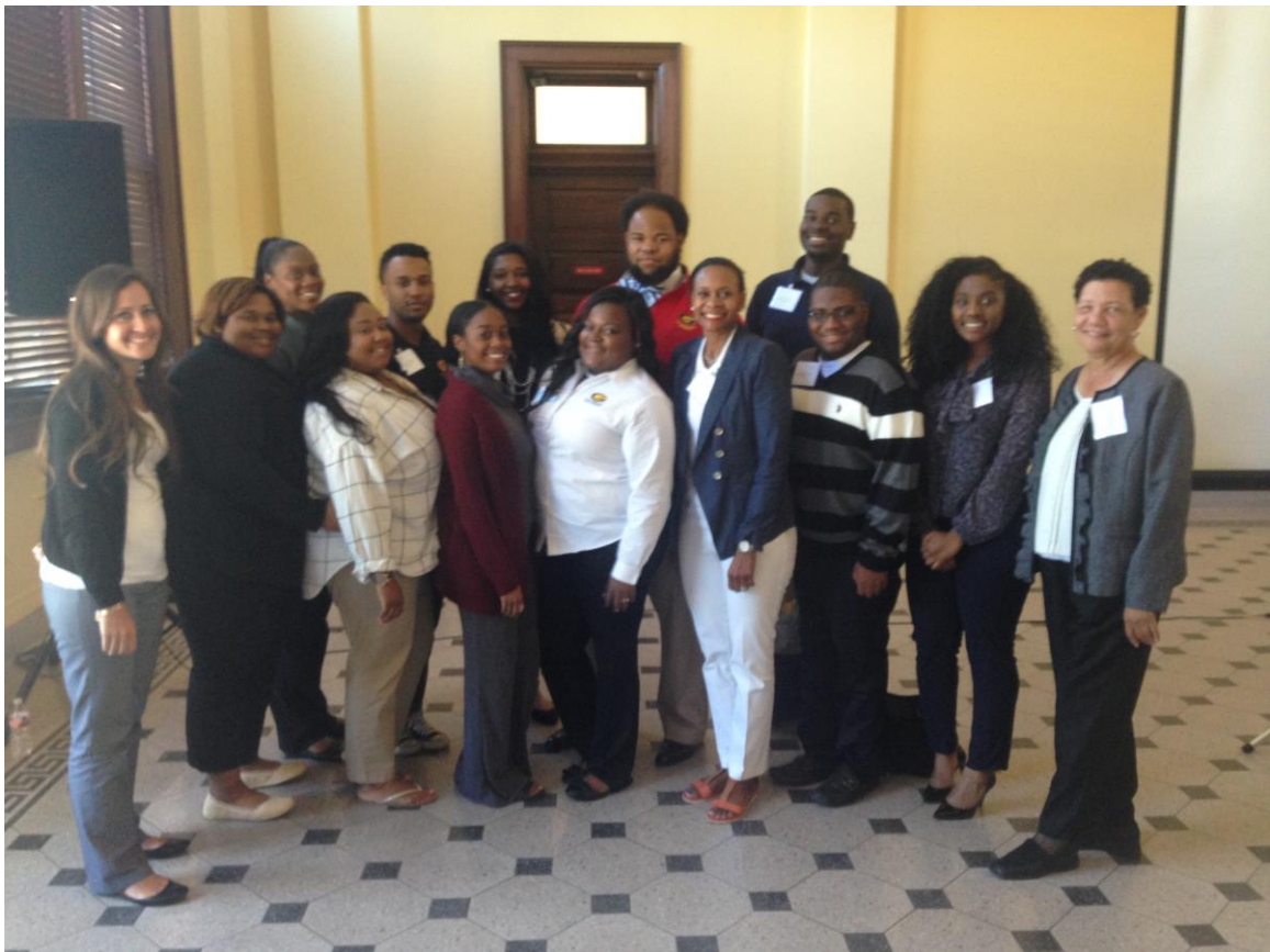
Exhibit 7.04 Student Internship Handbook