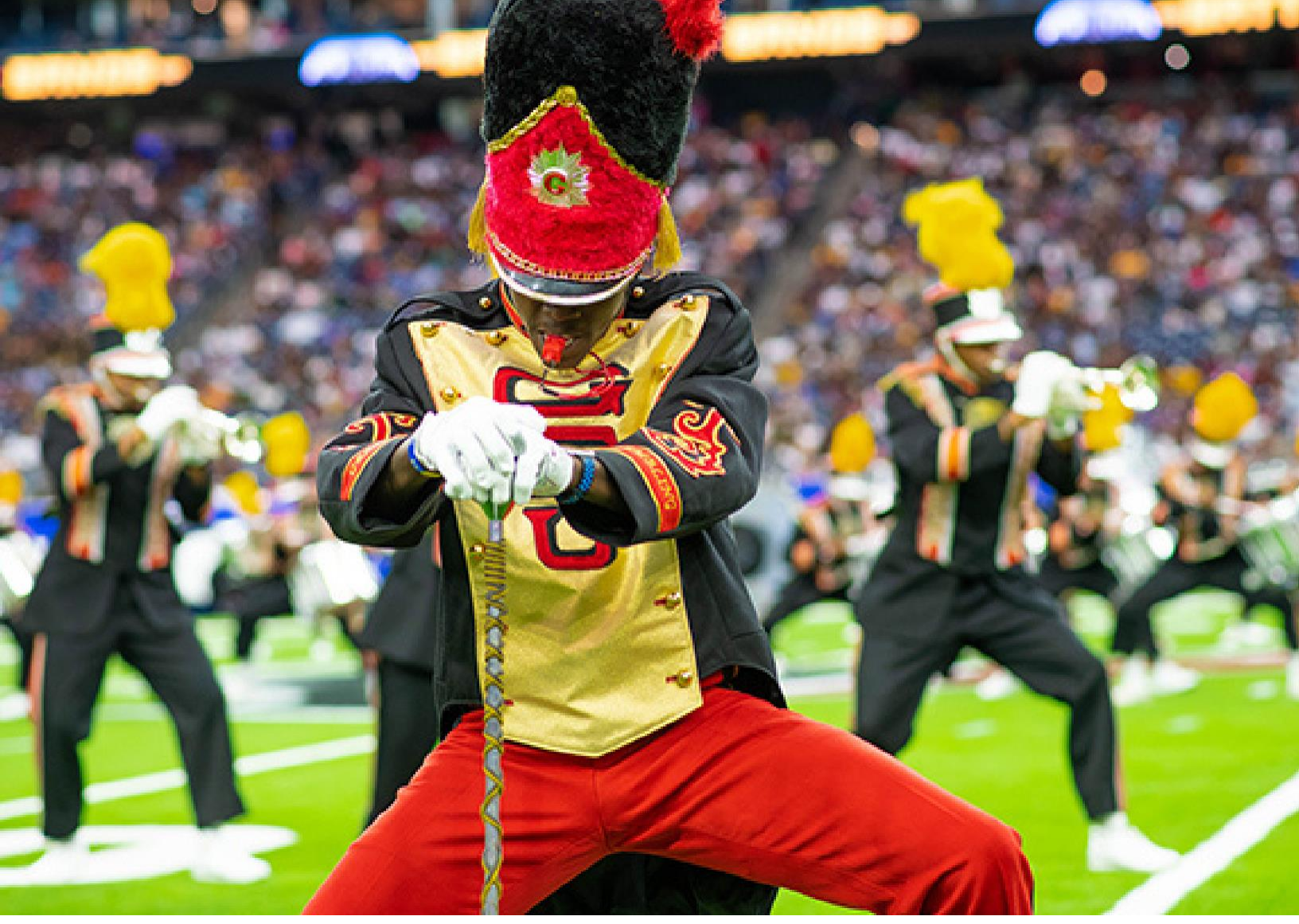
Testing, Exercise Preparedness Drills, and Tabletop

Exercises Under the institution's Emergency Operations Plan (EOP), Grambling State University will use its emergency procedures and plans for testing emergency notification, response, and evacuation. A test is defined as regularly scheduled drills, exercises, and appropriate follow through activities, designed for assessment and evaluation of emergency plans and capabilities.