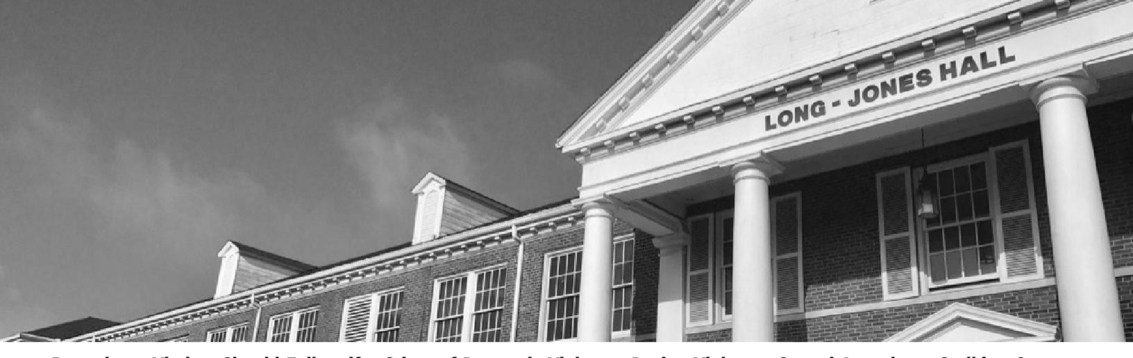
Procedures Victims Should Follow if a Crime of Domestic Violence, Dating Violence, Sexual Assault, or Stalking Occurs

After an incident of sexual assault, dating violence, or domestic violence, the victim should consider seeking medical attention as soon as possible at the Northern Louisiana Medical Center or GSU Student Health Center. Sexual Assault Nurse Examiners (SANE) are trained and certified in physical evidentiary recovery kit collection at the hospital. Evidence may be collected, even if the victim chooses not to make a report to law enforcement.