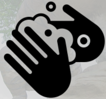
Adequate Hand Cleaning