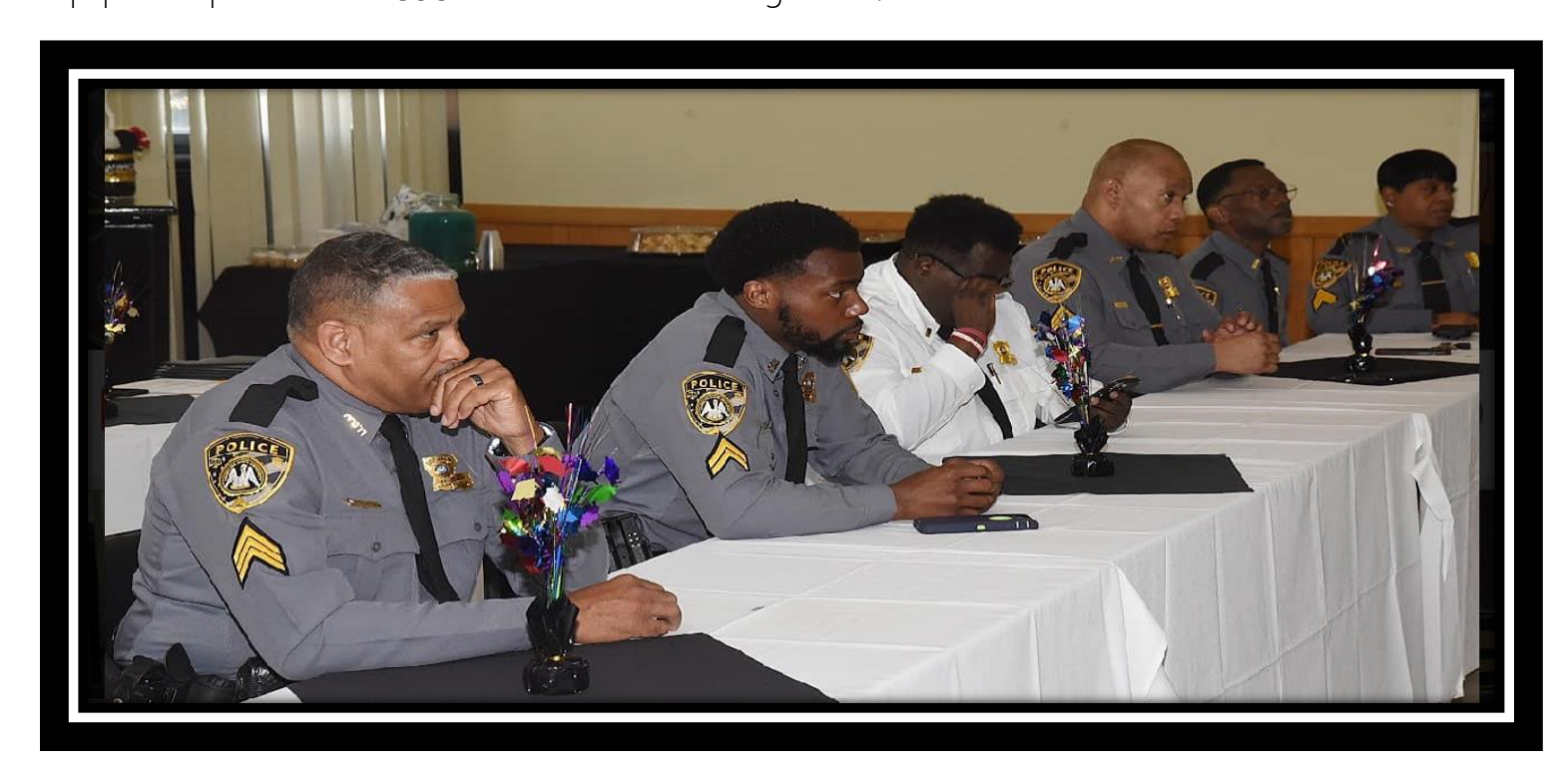
University Police Training

Campus community members can additionally report hazards directly to Facilities Management. The campus's overall safety and security program is supplemented by various technological systems, including; access control, closed- circuit television, emergency phones and fire detection, suppression, and reporting systems. Other members of the University community are helpful when they report equipment problems to GSUPD or Facilities Management.